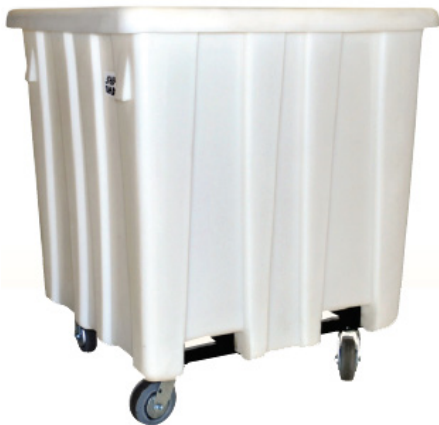
Optional casters allow manual handling when empty, optional fork safety tubes help secure load.

Overview: This rugged, durable bulk container made of High Density Polyethylene (HDPE) has features that contribute to easy lifting and storing and is taller than the P291.