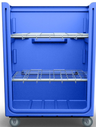
Wire shelves in vertical position